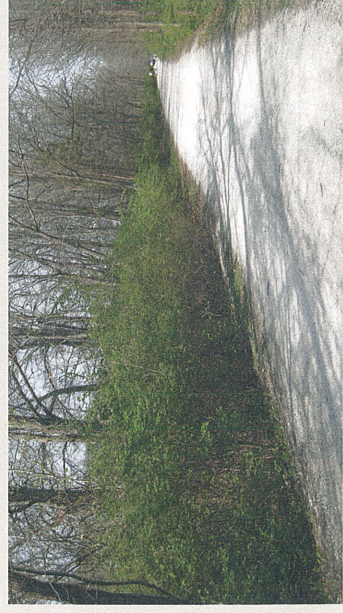
Bush honeysuckle is readily apparent in early spring.

Invasive bush honeysuckles are most easily identified in the early spring, when they leaf-out earlier than native shrubs and trees, or in the fall, when they are still green after our native plants have mostly dropped their leaves. They are dense shrubs—3 to 15 feet tall— with opposite leaves and pairs of red or orange berries near the base of the leaves in fall.