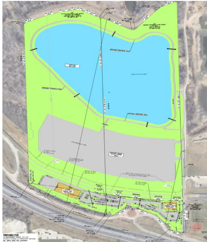
Preliminary Development Plan

Mr. Stock stated that the purpose of rezoning the 77.8 acres immediately west of the Chesterfield Sports Complex is to further the goals and objectives of Gateway Studios. The property would provide support services for the Gateway Studios site being developed east of the subject site.